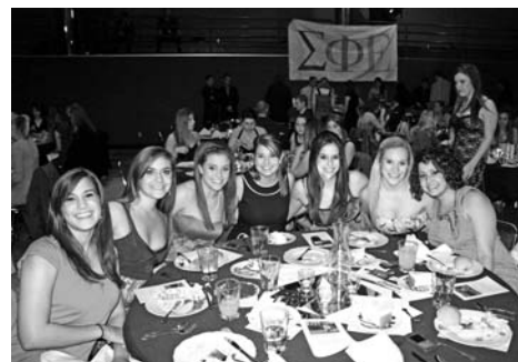
LADIES OF KAPPA KAPPA GAMMA